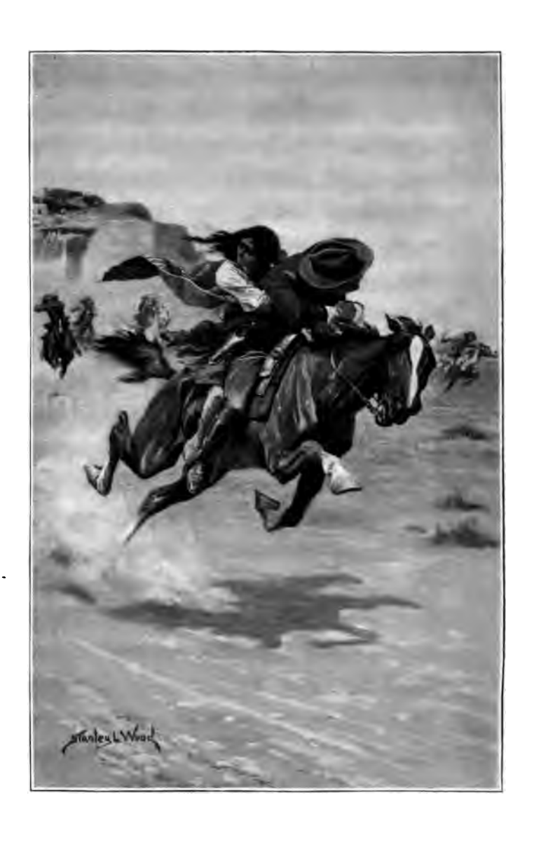
Wemple dug his spurs into its sweating side and the beast sprang forward at a faster gallop